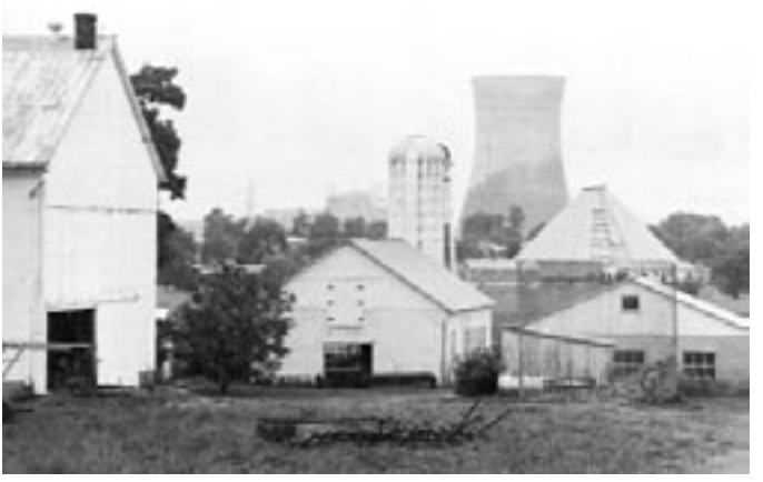
Figure 2. Farm in Londonderry Township near TMI, 4 July 1979.