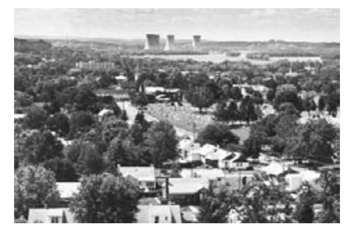
Figure 1. View of TMI from the roof of an apartment building in Middletown, Pennsylvania, 19 July 1979.

In the spring of 1984, Marjorie Aamodt initiated a household survey in three hilltop communities with a total population of about 450 people. All three neighborhoods had unobstructed views of TMI at distances of between 3 and 8 miles (Aamodt and Aamodt 1984). Two of the communities were areas