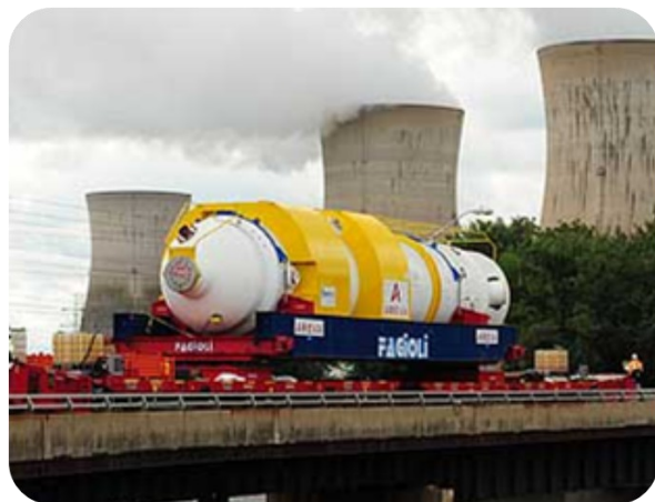
One of two new steam generators crossing the bridge to Three Mile Island .

Continued on page 3 Exelon is in violation of its reactor license