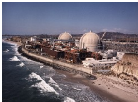
San Onofre—too costly to repair after faulty replacement steam generators were installed.

The California Public Utilities Commission ordered customers of Southern California Edison to pay $3.3 billion dollars of the costs. Customers will keep paying millions of dollars a month for a power plant that has not produced any electricity since 2012.