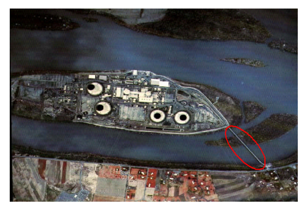
This overhead photograph highlights the north entrance bridge at TMI